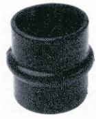
HUMP HOSE RUBBER