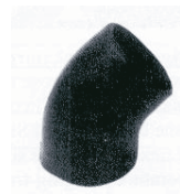
RUBBER BEND 45°