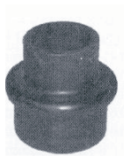
HUMP HOSE REDUCER RUBBER