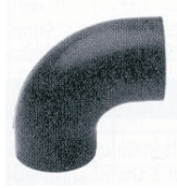
RUBBER BEND 90°